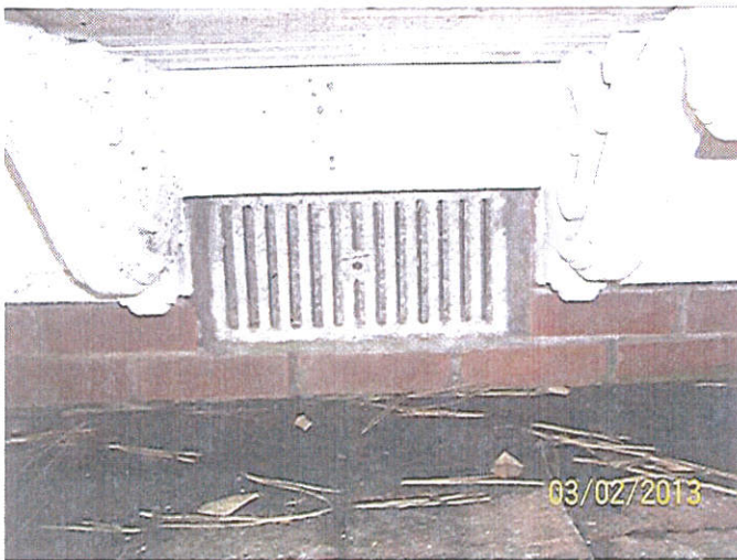
View of Representative Vent

Date of Photograph: (See Photo Date Stamp)